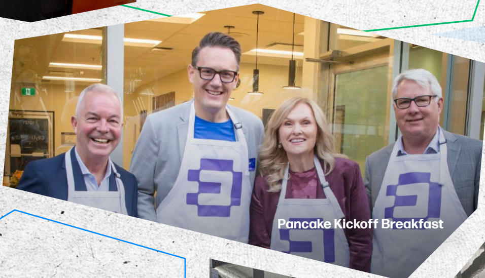
Pancake Kickoff Breakfast

New events made a splash, including the Pancake Kickoff Breakfast, Women in Tech & Innovation, Mega Meetup, DevCon, and the Venture Summit . These additions created new spaces for founders, investors, and industry to connect.