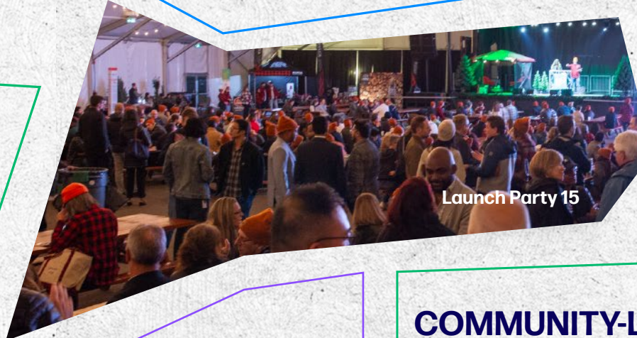
Launch Party 15