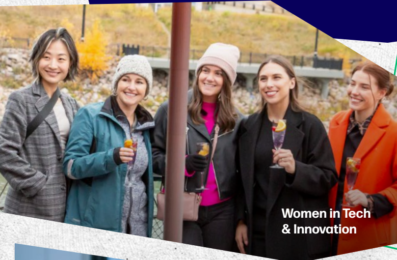
Women in Tech & Innovation

The theme for Edmonton Startup Week was Think Bigger—and that's exactly what happened. Over five days, we saw more than 5,600 people register for 60 events that showcased the energy, creativity, and momentum of our entrepreneurial community.