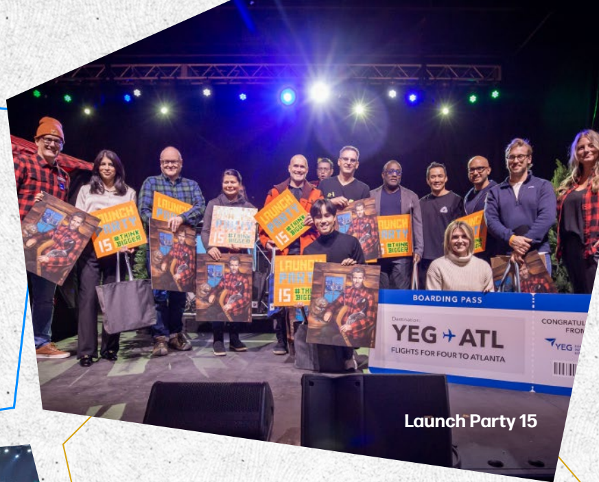
Launch Party 15

Launch Party celebrated the most promising startups with a Canadian Bush Party -theme.