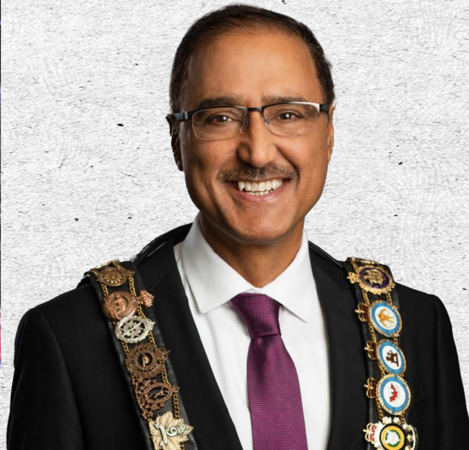
Amarjeet Sohi Mayor of Edmonton

I want to thank the Edmonton Unlimited Board, staff, and partners for their unwavering dedication to our city's prosperity. Together, we will continue to build a strong and economically thriving city – one that fosters innovation, embraces diversity and empowers all Edmontonians to make their dreams a reality.